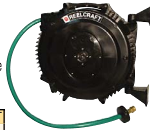
Series S SWA3850 OLP

*Water reel with garden style hose end **Air or water hose reel