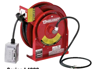
Series L4000 L 4545 123 7