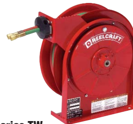
Series TW TW5425 OLPT