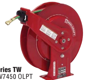
Series TW TW7450 OLPT