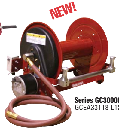
Series GC30000 GCEA33118 L12D

Series GC motor driven reels include hose roller guide, operating switch (600808) and chain guard.