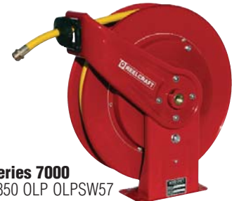
Series 7000 7850 OLP OLPSW57