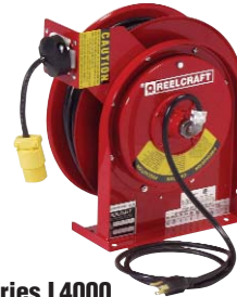
Series L4000 L 4545 123 3