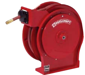
Series 5005 5650 OLP

✓ Great for turf care, golf courses, clubhouses and maintenance facilities.