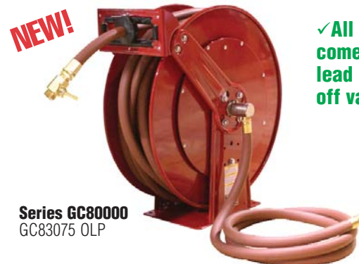
Series GC80000 GC83075 OLP

✓ All GC models come complete with lead hose and shut off valve.