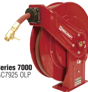
Series 7000 GC7925 OLP