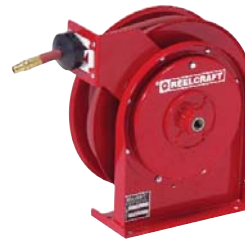
Series 4000 4625 OLP