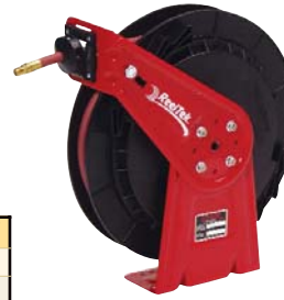
Series RT RT635-OLP