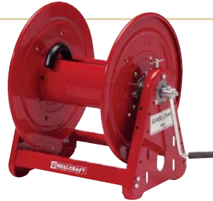
Series 30000 CA33112 L