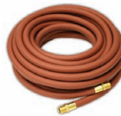
AIR & WATER HOSE ASSEMBLY LOW PRESSURE