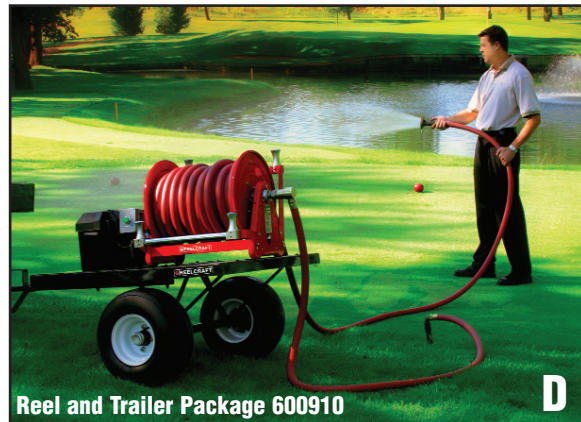
Reel and Trailer Package 600910

Great for golf courses, athletic fields, parks & rec.